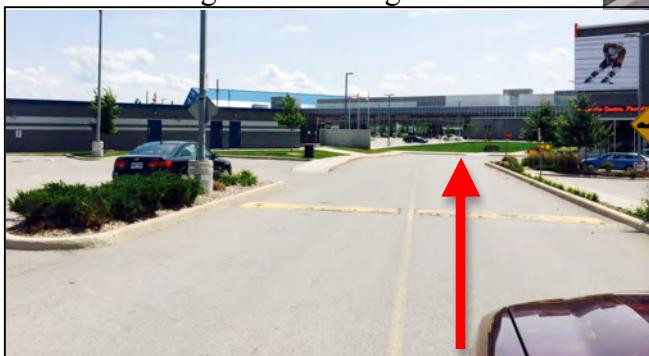
Figure 1 - Pulling in